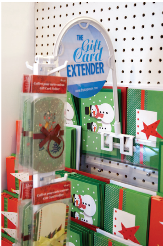
The Gift Card Extender shown with the MAX Merchandising System

Double sided graphics can be displayed using our integrated card clips. An additional header card clip is located on the Double Clip attachment.