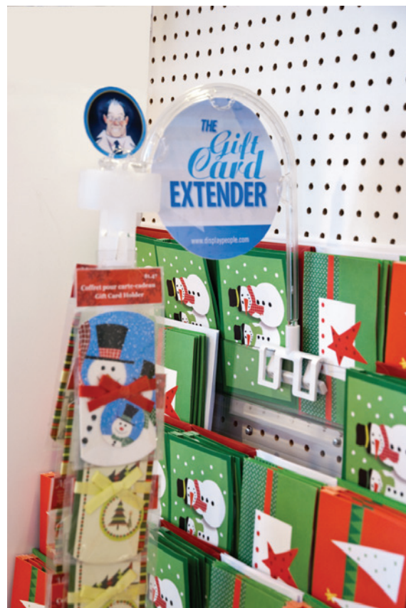
The Gift Card Extender shown with the Clip Strip Attachment and two Locking Strip Retailers