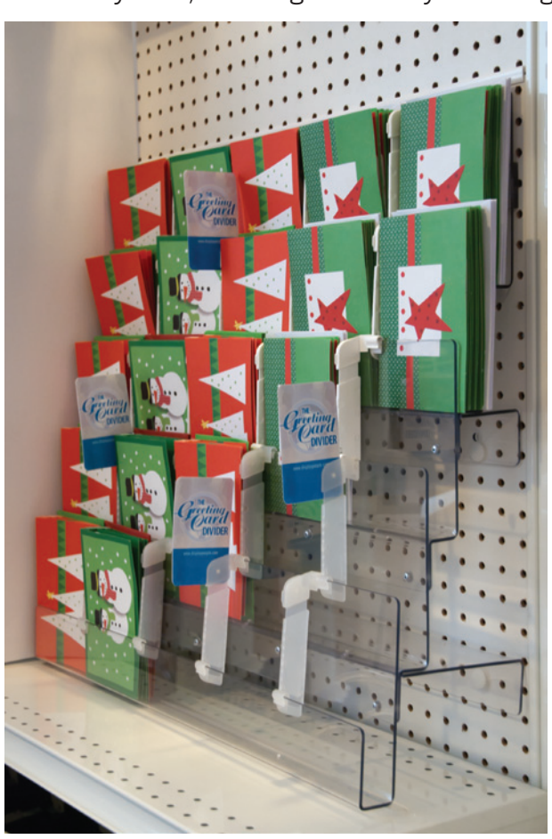
Greeting Card Dividers with graphic cards shown organizing a card rack

The integrated folding signholder allows double sided graphics to be mounted to the NEW divider system, creating secondary branding opportunities!