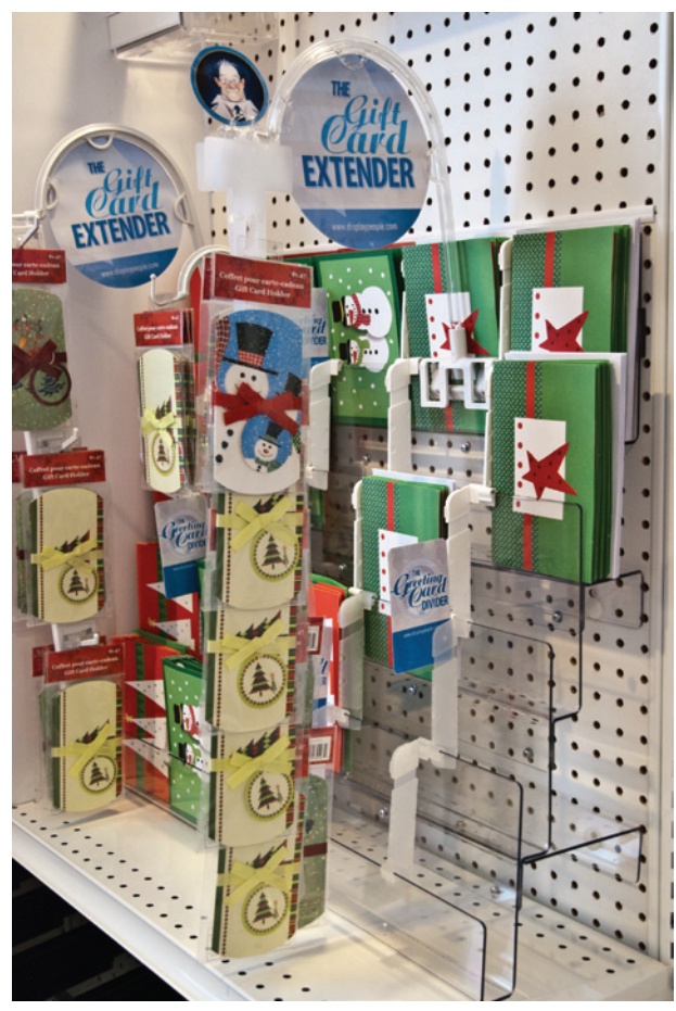
Greeting Card Dividers shown in use with the Gift Card Extender