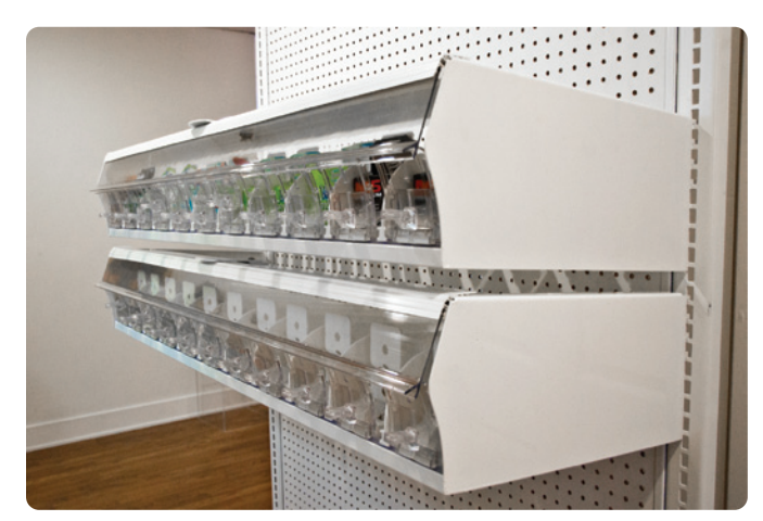
Take-1 Security Pusher System in a metal rack, mounted directly to uprights

Attach the Take-1 security systems easily installed components to your existing shelves. The flip door mounts to the shelf above.